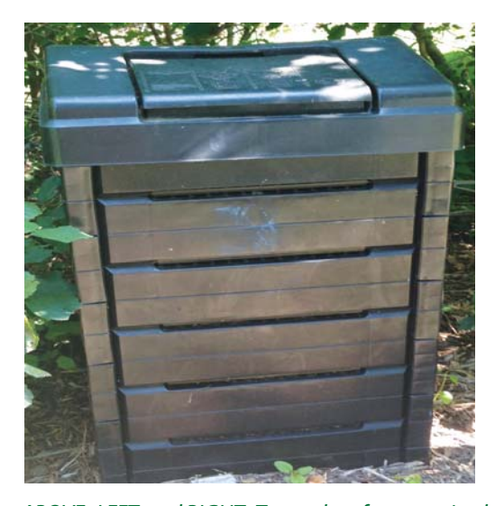
ABOVE; LEFT and RIGHT: Two styles of composting bins.

Composting is when you separate out your kitchen vegetables and yard waste at home, and place it into a special pile so that it that breaks down into a natural, soil-like product that can be used as fertilizer.