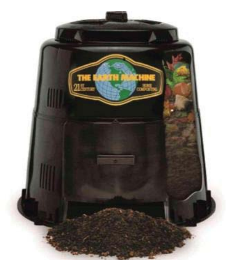
Left: Composting display at Deep Cut Gardens, Middletown. Right: "The Earth Machine" recommended by Monmouth County for home gardening composting.