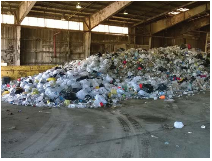
LEFT: All the garbage in Monmouth County is brought to the Reclamation Center in Tinton Falls where it is compacted then placed in the landfill. RIGHT: Recycling facility

If you live in Monmouth County, the following items <u>must be recycled</u> (they are banned from the landfill). SEE CHART (PP. 6-9) FOR INSTRUCTIONS ON WHERE TO RECYCLE.